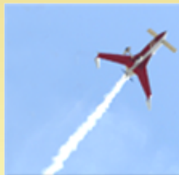
AMATEUR & EXPERIMENTAL AIRCRAFT